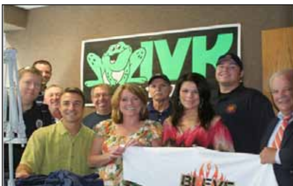
FOP and IAFF members visit radio station WIVK in Knoxville, TN requesting airplay.

The FOP Foundation is a nonprofit, tax exempt organization dedicated to assisting FOP members in times of need due to tragic unforeseen circumstances. The Foundation Funds provide financial assistance to the families of law enforcement officers that are wounded or killed in the line of duty, or develop a duty-related life threatening illness. The Foundation also supports the Disaster Relief Fund, which, with recent hurricanes, tornados, and flooding that has heavily impacted FOP members and their families, has provided much needed resources.