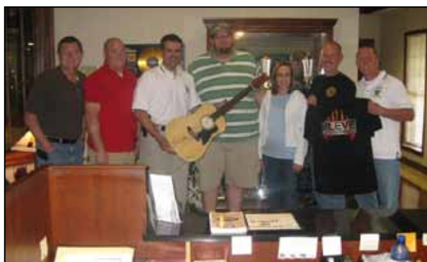
In Chattanooga, TN FOP and IAFF members visit radio station WUSY.